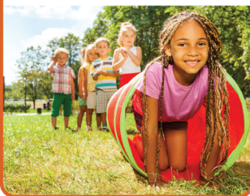
Wait and take turns