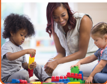
Ask for help