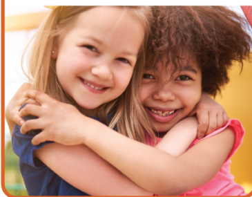
Ask for a hug