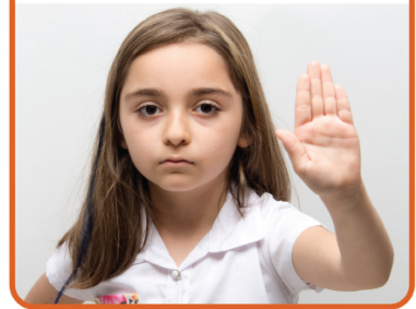
Say, "Please, stop."