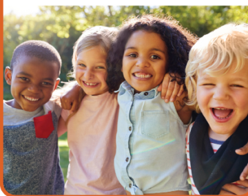
Use kind words