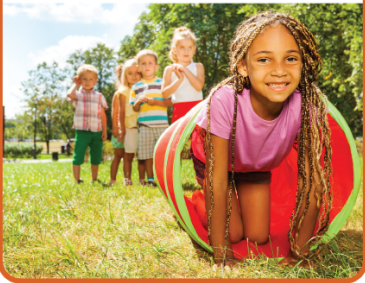
Wait and take turns