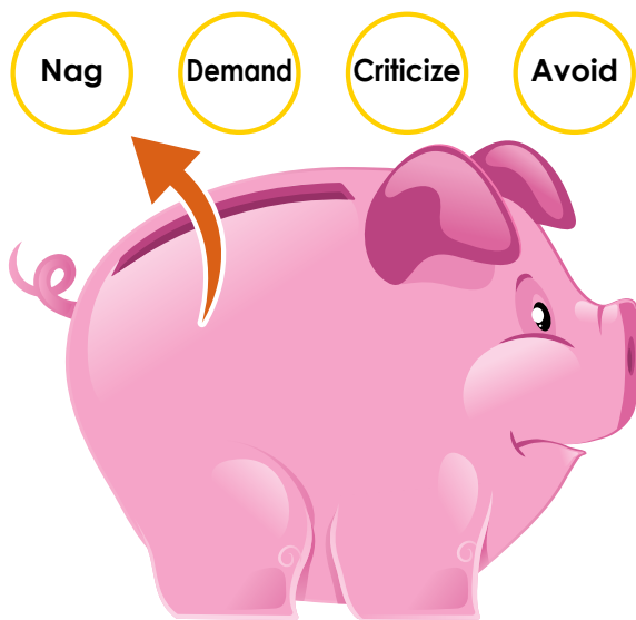
Figure 2. Making relationship withdrawals

Undoubtedly teachers and child care providers strive to build positive relationships with all of the children in their care. Typically, we have the best relationships with children who respond to us, seemingly like us, and go along with our plans. But as you know, it is more difficult to build positive relationships with some children than with others. We have all had experience with children who push our “hot buttons.” Maybe they demand more attention than others, are disruptive, unmotivated, oppositional, aggressive, or do not give us the positive feedback we get from others. When our