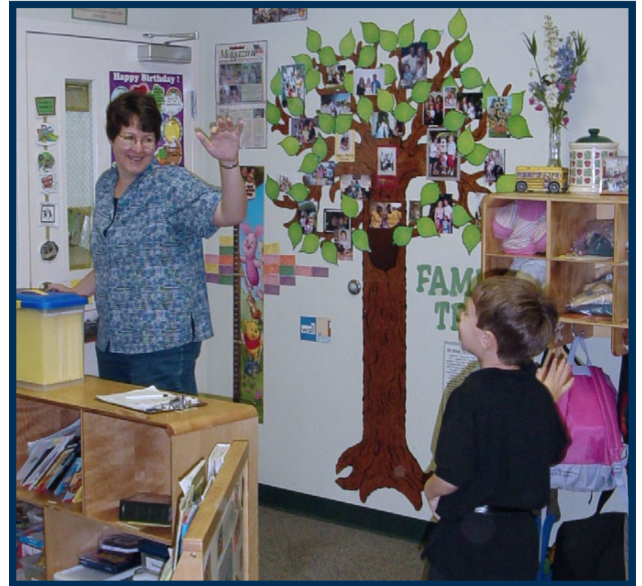
Naganagwaa niniigi'igoog niwiindamaagoog, "Apegish minoseyan noongom."