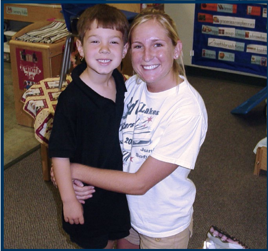
Kuv hais “Nyob zoo” rau kuv tus xib fwb.