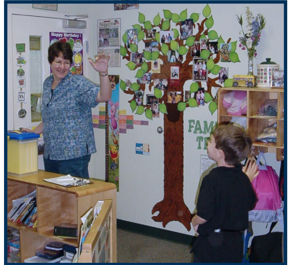
Kuv hais sib ntsib dua rau kuv Niam los yog kuv Txiv. Lawv hais, “Muaj kev lom zem hnuv no!”